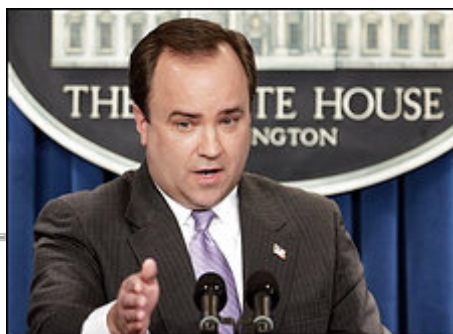
▲ Former White House Press Sec. Scott McClellan

MR. McCLELLAN: "[...] There is some classified information that -- well, there's some information that remains classified for national security reasons. But we felt that this information -- which is what the State of the Union statement was originally based on -- was important to share with the American people, because it could be declassified."