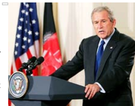
▲ George W. Bush

"Vice President advised defendant that the President specifically had authorized defendant to disclose certain information in the NIE." ( Fitzgerald filing )